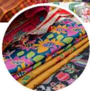
Kantha display and live interaction at the festival