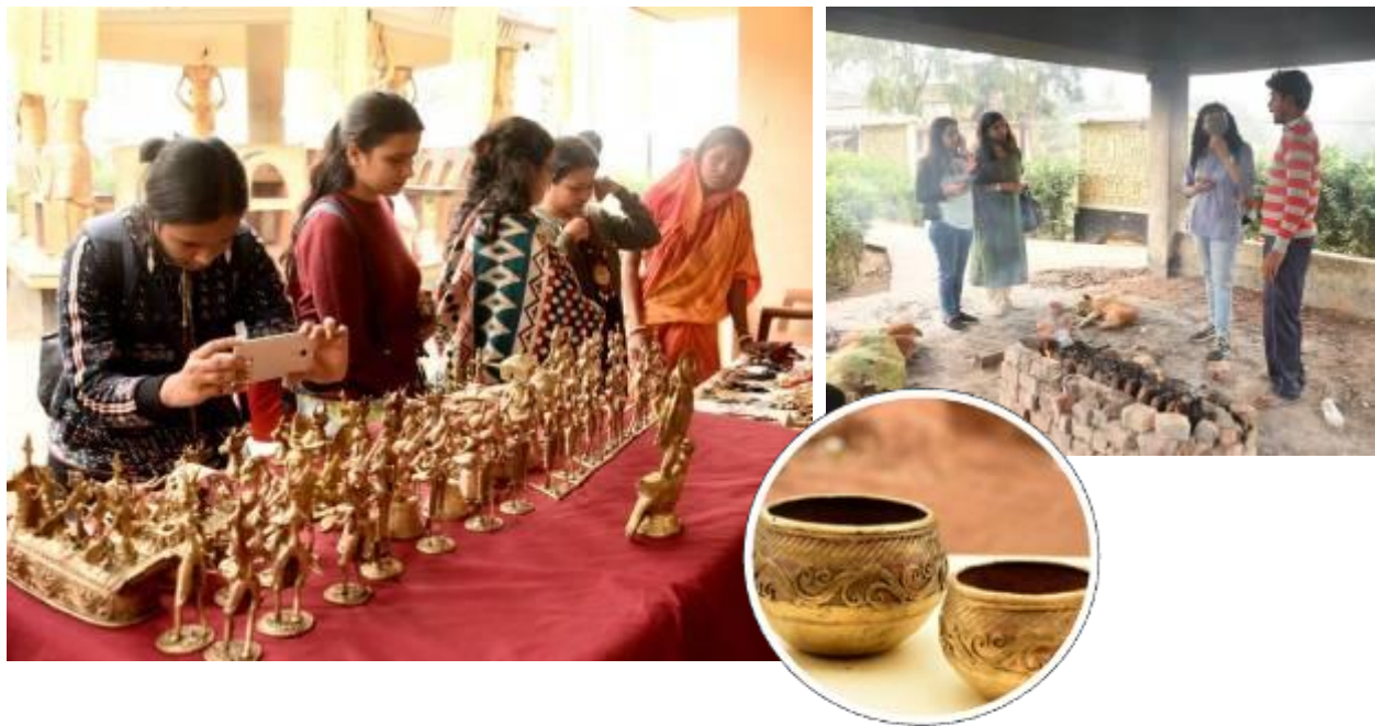
Dokra display online and at the festival ground

Dokra, an ancient craft, involves one of the earliest methods of non-ferrous metal casting known to human civilization. The craft has also received the Geographical Indication (GI) tag. Ripples Festival Season 2 brought forth Dokra of Dariyapur where around 20 artists showcased a wide range of traditional and diversified handmade artifacts comprising lanterns, showpieces, jewellerys, wall hangings, idols, masks, candle stands amongst others. People from in and around Kolkata visited, indulged in these rustic beauties, bought and interacted with the makers. The festival acted as a catalyst between artists and business persons where the latter showed interest to work with artists in the future. During this festival visitors also had a chance to witness the complex making of Dokra. The festival in Dariyapur started with a Facebook live session where people had a chance to interact from the comfort of their homes. Exhibition and live demonstration of the craft was held between 11 am and 7 pm. Dokra artists had a total sale of Rs.1,00,000 at the Ripples Festival Season 2.