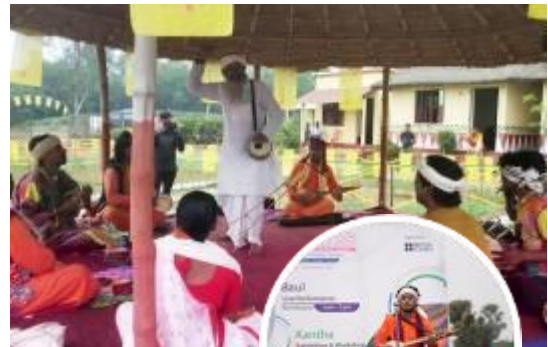
Baul performance at the festival