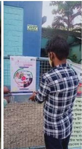
Postering at different venues