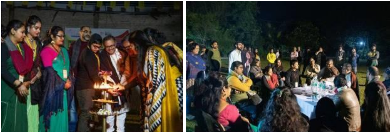
Inauguration of the theatre festival at Tepantar